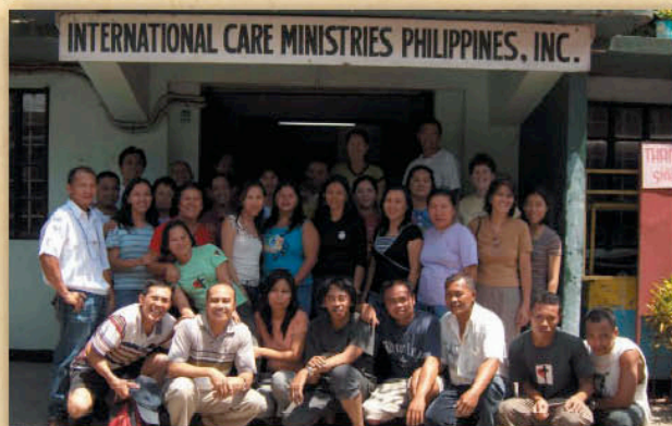
ICM Bacolod, Negros Occidental