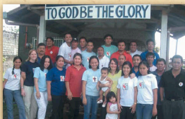
ICM Dumaguete, Negros Oriental