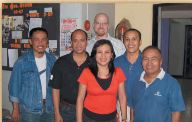
The ICM Executive