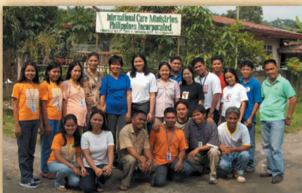
ICM General Santos, Mindanao